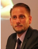
Para Taekwondo Committee Member