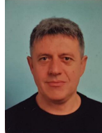
Para Taekwondo Classification Committee Member